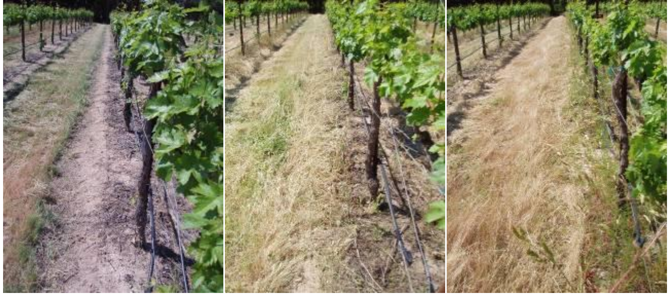
Figure 5. Weed populations in vines treated with a conventional pre-emergent herbicide (left), with steam (center), and no weed control (right).

affected by the different treatments, and no differences in pruning weight or grape yield were detected. This was not a surprising result because it had been previously seen that grapevines are capable of tolerate high levels of weed competition without reducing yield, at least in the short term.