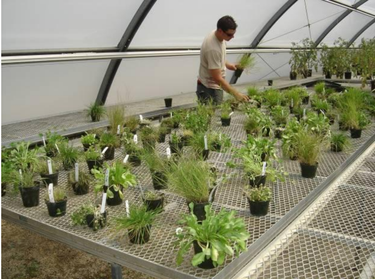
Figure 2. Arrangement in the Greenhouse of experiment testing for steaming effect on several weed species.

The experiment was arranged as a completely randomized design with six treatments (combinations of three developmental stages and two steaming treatments: with and without) and four replications (Figure 2). The experiment was conducted twice to confirm reproducibility of results.