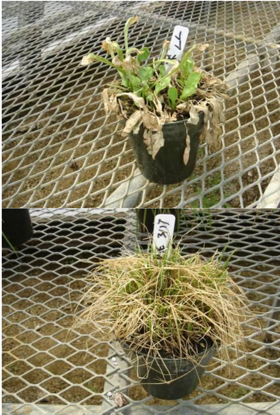
Figure3. Typical injury shown by weeds such as english daisy (up) and perennial ryegrass (down) 3 days after steaming. The leaves that were exposed to the steam became necrotic and died. Smaller leaves that were shaded by the larger leaves avoided the steam thus surviving and staying green.