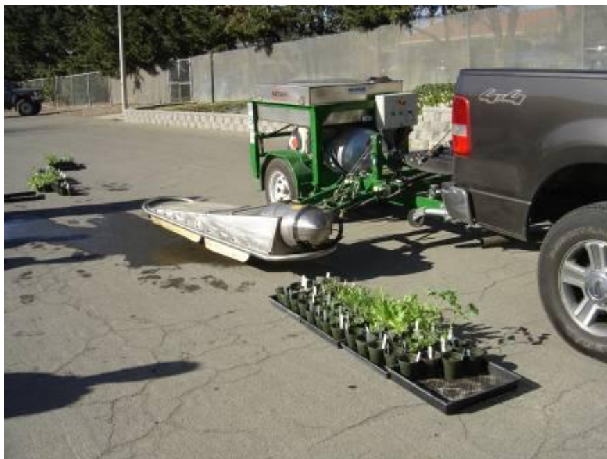
Figure 1. Steaming several weed species using the Stinger.

When the plants reached the desired developmental stages, they were steamed at 400 C driving the Stinger at 1.5 mph with the steam jet output being at 2-3 inches above the canopy of the plants (Figure 1). Half of the plants for each developmental stage were treated and half were not to be used as controls.