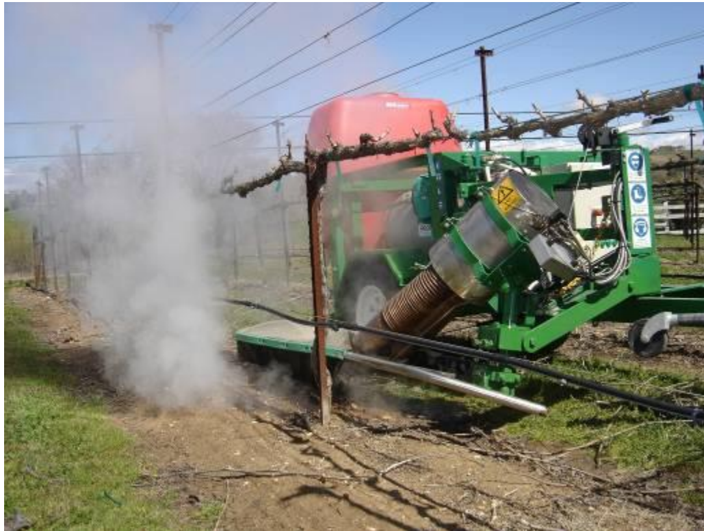
Figure 4. Steaming with the Stinger under a grapevine row in Zinfandel vineyard in Paso Robles, CA.

The experiment was arranged as a randomized complete block design with three replications, and each experimental unit was a row with approximately 50 vines. Visual weed control was determined 3 and 7 days after treatment. In addition, weed density and grapevine canopy were determined once a month. Finally, at the end of the growing season weed biomass per area, grapevine pruning weight and fruit yield were evaluated.