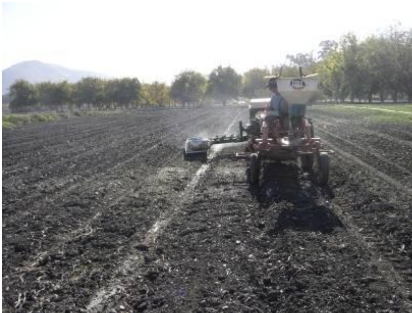
Figure 6. Steaming beds before crop transplanting in an organic vegetable farm using the Stinger.

Throughout the discussions with growers, there was a recurrent theme, which was the need for a more versatile design of the Stinger or any other steaming unit. It was proposed that the water and propane tanks could be directly attached to a tractor and the steaming unit should be independent and able to be moved to steam sideways, backwards, rows, beds or flat areas, and that the width of the steaming area could be controlled similarly to what growers do with cultivation and spraying equipments.